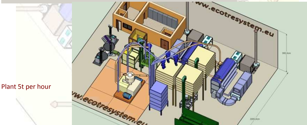
Plant 5t per hour